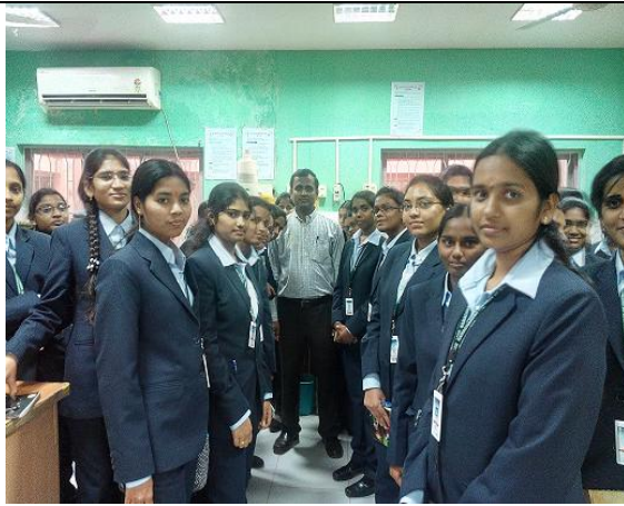
Students visiting Research Laboratory