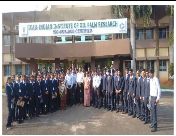
Gathering of students in front of IIOPR