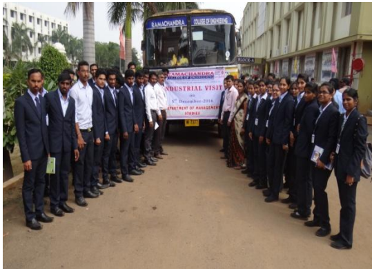
Gathering of students with faculty before going to IIOPR visit