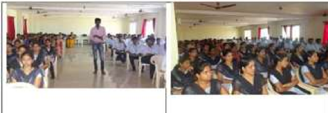
Signature of the Organizer