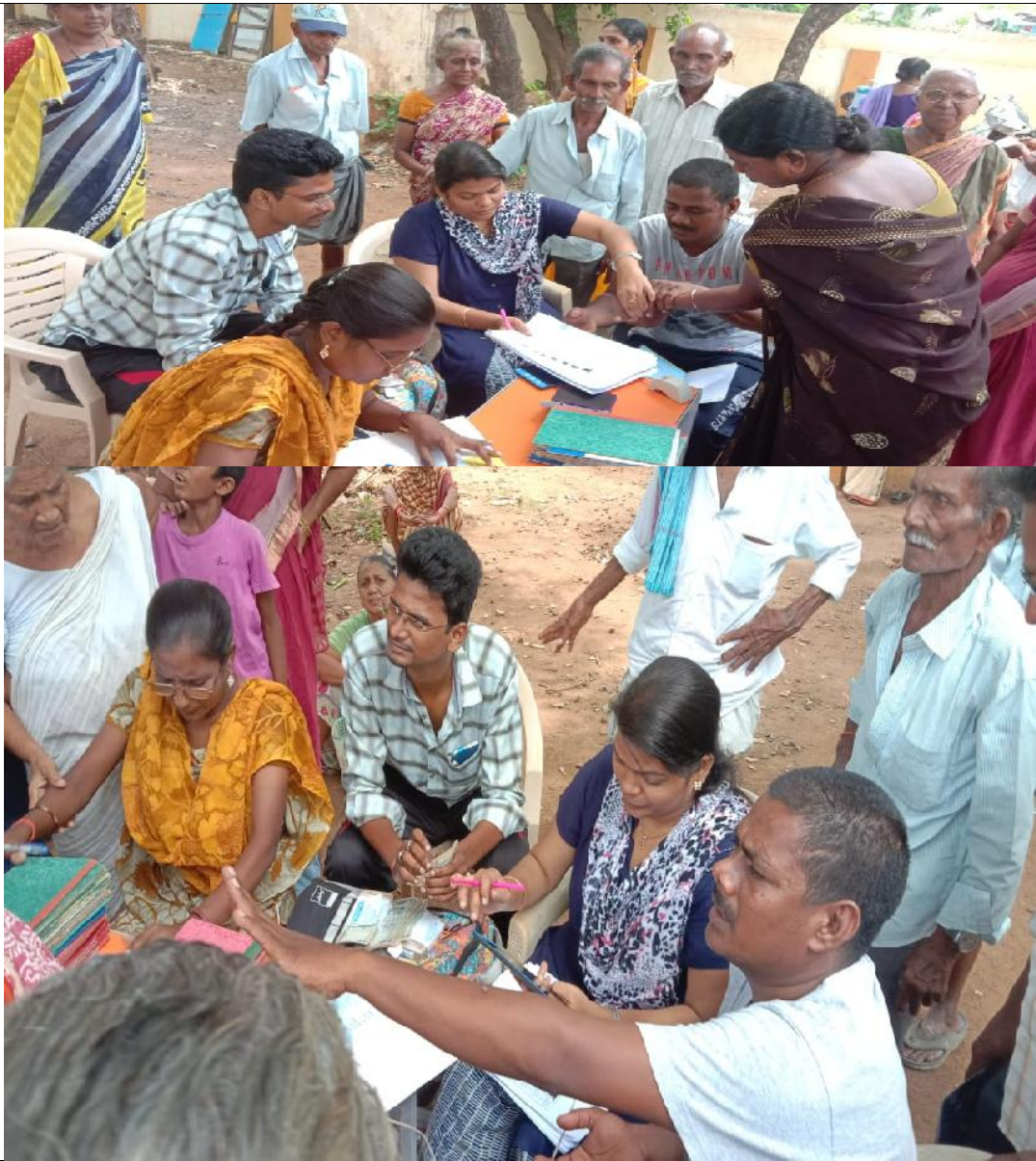
Feedback from students:

It is a great experience for give me this opportunity given by our college We are very happy to participate in this event and helping villagers made us very proud.