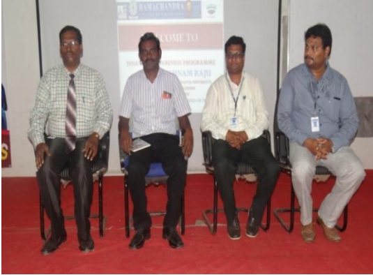
welcome the dignitaries on the Dias