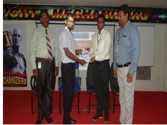
Principal presenting a book to Resource person