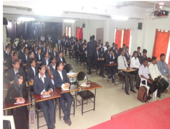
Students and staff during the financial awareness program